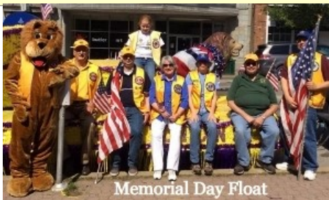
Memorial Day Float

We (and the Butler community) will sincerely accept whatever service you can provide.