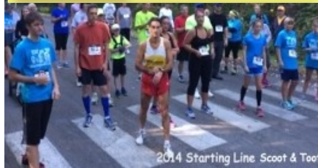
2014 Starting Line Scoot & Toot