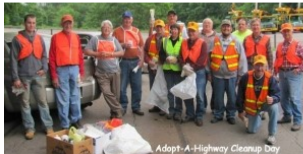
Adopt-A-Highway Cleanup Day