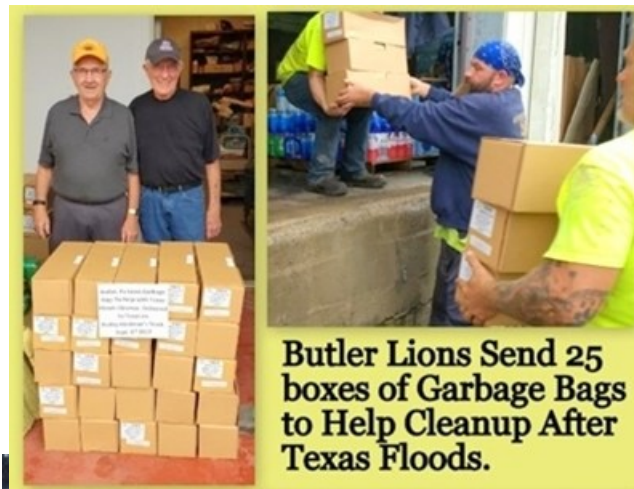
Butler Lions Send 25 boxes of Garbage Bags to Help Cleanup After Texas Floods.